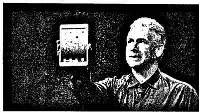
Apple senior vice-president of worldwide marketing Philip Schiller introduces the new iPad mini during an Apple event in San Jose, California on Tuesday.

Apple also introduced an upgrade for its iPad, which includes a faster processor and the new Lightning connector. It also showed new laptop and desktop computers. Phil Schiller, Apple's vice president for marketing, said the smaller, lighter tablet would be a good fit for people who want something more portable than the 1.44 pound iPad.